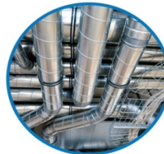
INSTALLATION & SITE MANAGEMENT