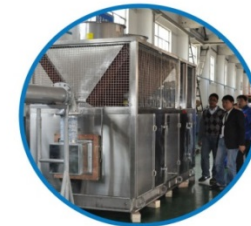
ACCEPTANCE TEST & QUALITY CONTROL

OUR CAPABILITIES Total HVAC&R Solutions and Global Project Management