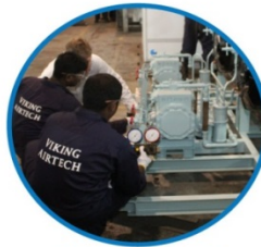
SERVICE & MAINTENANCE