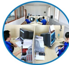
ENGINEERING, DESIGN & PROCUREMENT

What differentiates us from competition is the fact that we can adequately provide a total solution to all the customers needs from initial requirement to service and maintenance