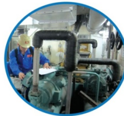
START-UP & COMMISSIONING